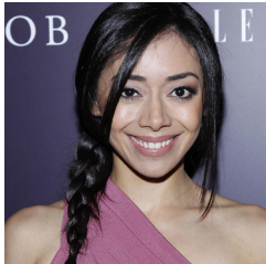
AIMEE GARCIA ACTRESS