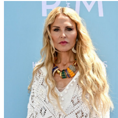
RACHEL ZOE FASHION DESIGNER