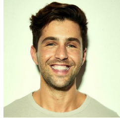
JOSH PECK ACTOR