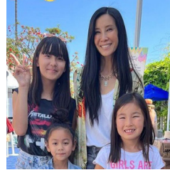
LISA LING JOURNALIST