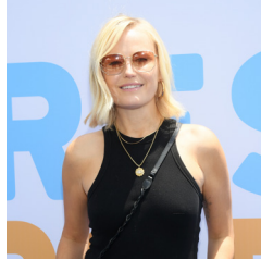
MALIN AKERMAN ACTRESS