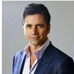
JOHN STAMOS ACTOR