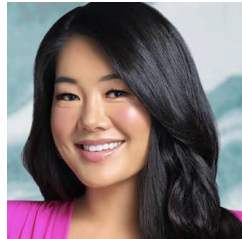
CRYSTAL KUNG MINKOFF TV PERSONALITY