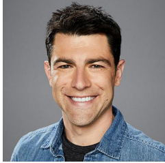
MAX GREENFIELD ACTOR