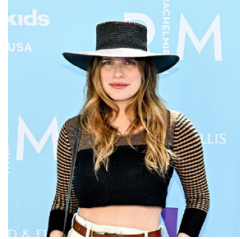
LAKE BELL ACTRESS